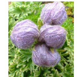
Fig. 2.c Delphinium brunonianum