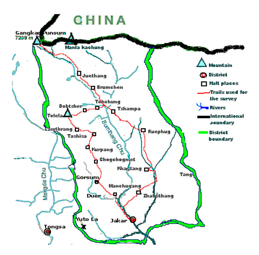
Fig 1: Survey area showing the trails and the halt places used during the survey